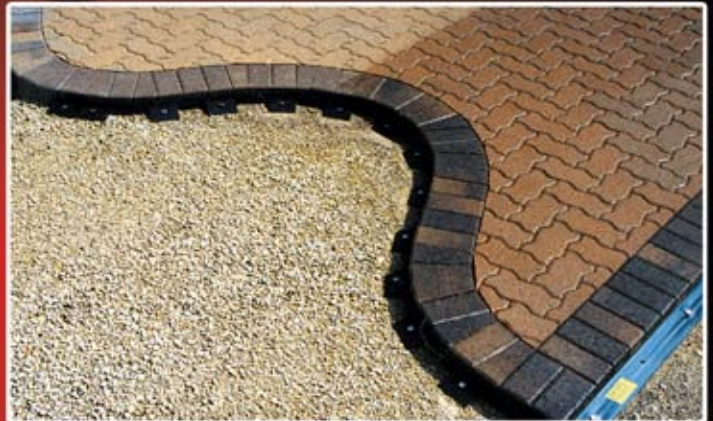
PAVERGUARD before and after