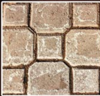
Winter Salt Buildup